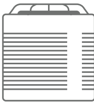
HEATING, COOLING & VENTILATION