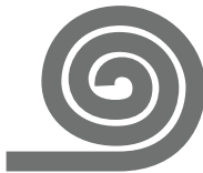
INSULATION & AIR SEALING